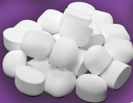
X-SMALL (3 x 4.5mm)