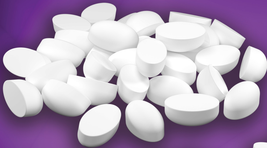
MEDIUM (5.5 x 9.5mm)