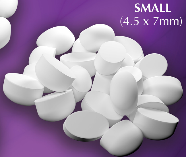
SMALL (4.5 x 7mm)