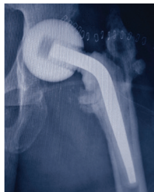
Stainless steel rod reinforces the femoral stem

The REMEDY® Hip Spacer is part of the treatment foreseen in a two-stage procedure performed in the event of permanent prosthesis infection. The REMEDY® Hip Spacer implant is intended for temporary use only (180 days or less). It allows basic joint mobility and releases antibiotics into the joint area to protect the implant from bacterial colonization. A second surgery will be required at a later date to remove the REMEDY® Hip Spacer and replace it with a permanent hip joint implant.