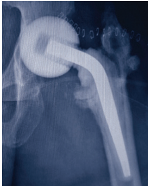
Stainless steel rod reinforces the femoral stem

The REMEDY® Hip Spacer is part of the treatment foreseen in a two-stage procedure performed in the event of permanent prosthesis infection. The REMEDY® Hip Spacer implant is intended for temporary use only (180 days or less). It allows basic joint mobility and releases antibiotics into the joint area to protect the implant from bacterial colonization. A second surgery will be required at a later date to remove the REMEDY® Hip Spacer and replace it with a permanent hip joint implant.